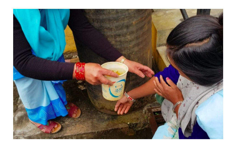
150 FCVHs were trained in 3 rural municipalities covered by the research project: Rasuwa, Makawanpur and Dhanusha districts.

The training included information on different types of wound and how they need to be looked after, We also discussed the way in which the time of year can make a difference to the risk of getting a burn, as well as the best way to refer patients to the right place to make sure they get the help they need. Participants discussed prevention strategies, such as better placement of cooking stoves or improving household wiring systems, and local erroneous beliefs. This was the first time FCHVs had received any training about burns and they committed to sharing what they had learned when they returned to their own communities.